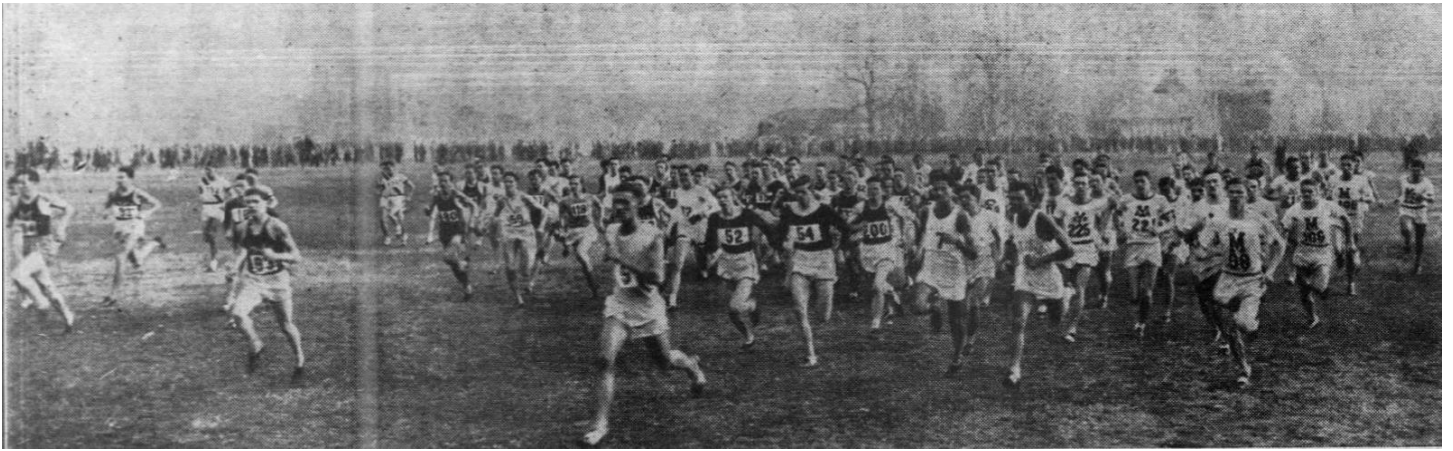
Spread out at the start