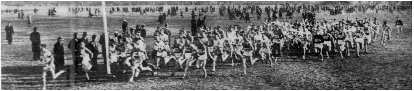
At the first turn