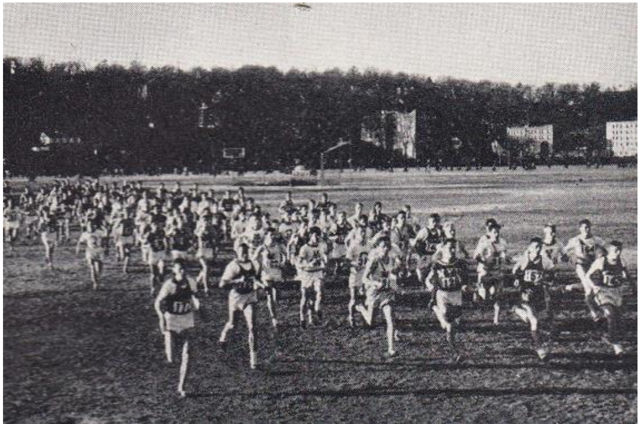
Runner sprint across the parade ground at the start of the 1938 University race.