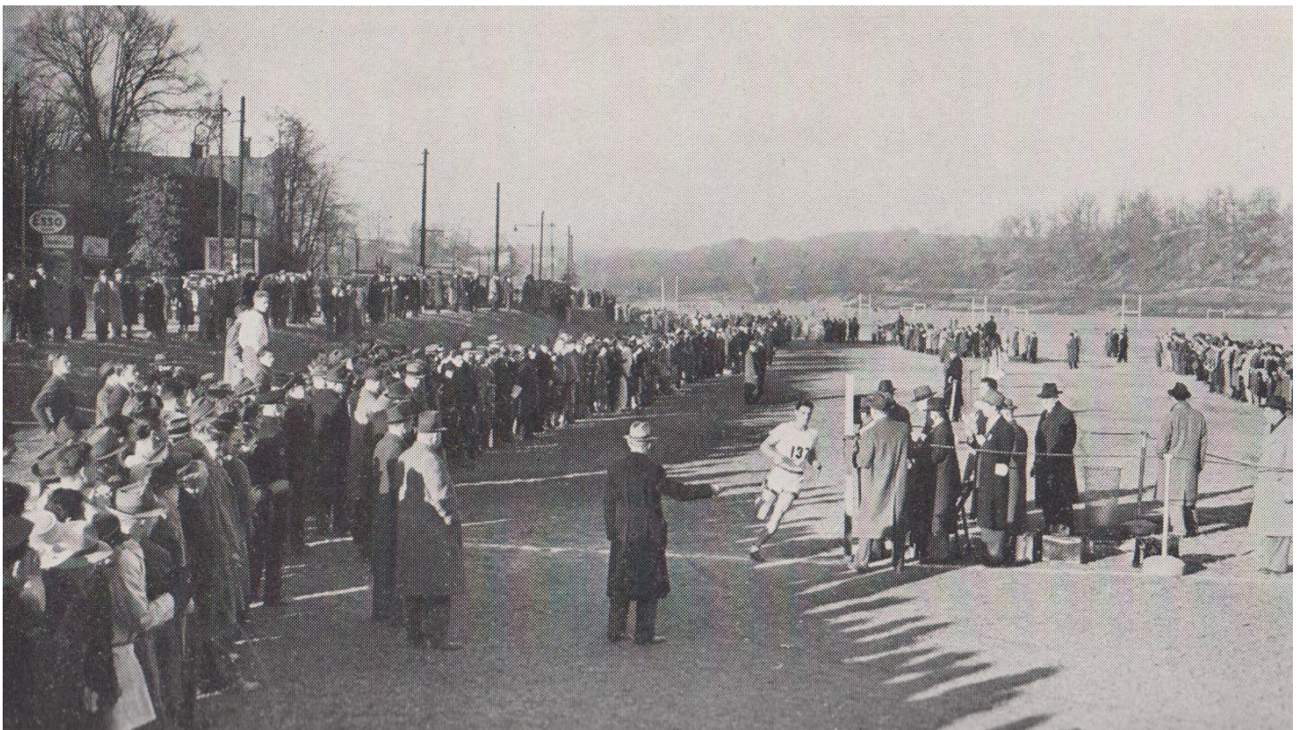
Half-way through, MacMitchell is all alone, no competitors in sight.