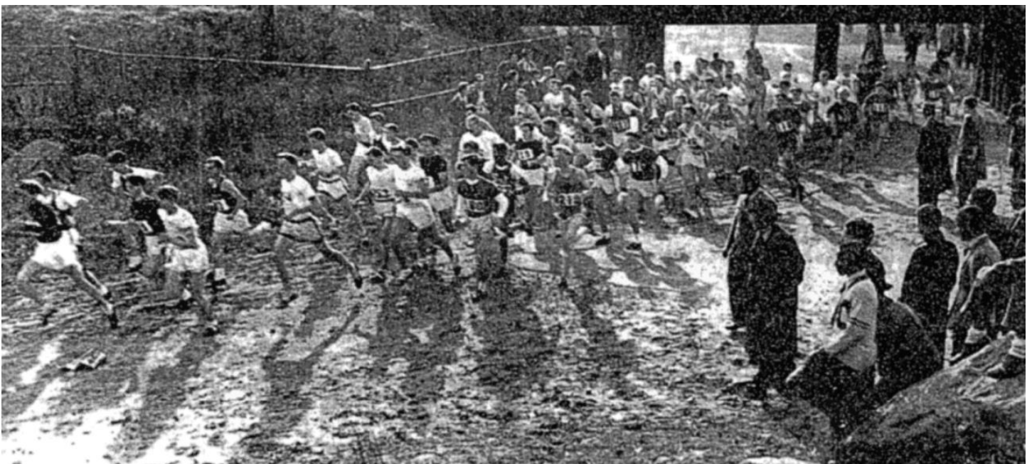
Shortly after the start of the 1942 Championships at Van Cortlandt Park