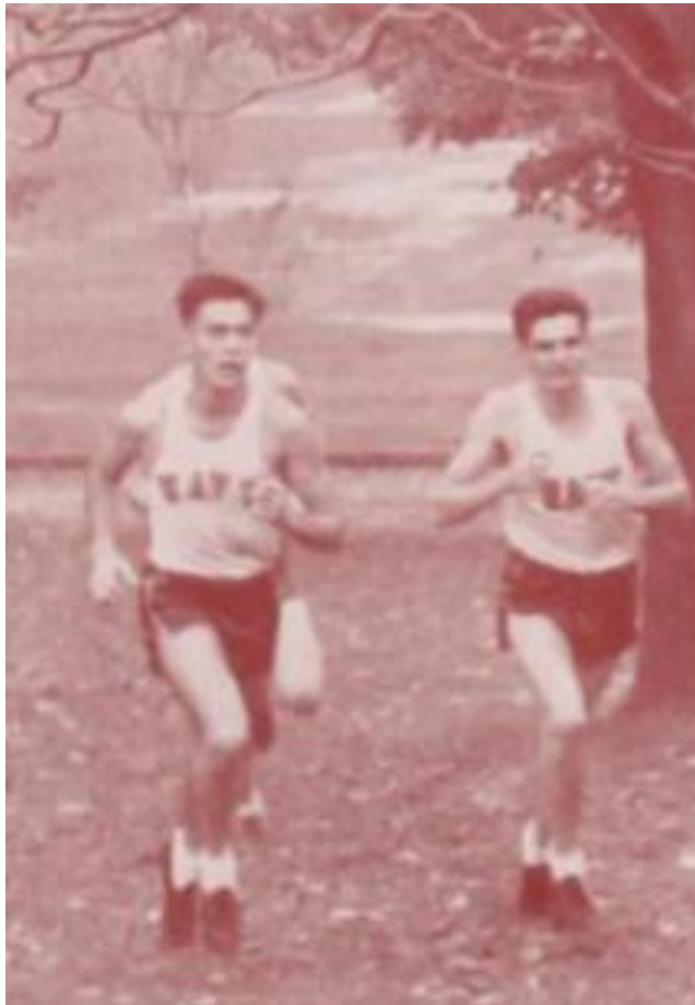
Up the hill