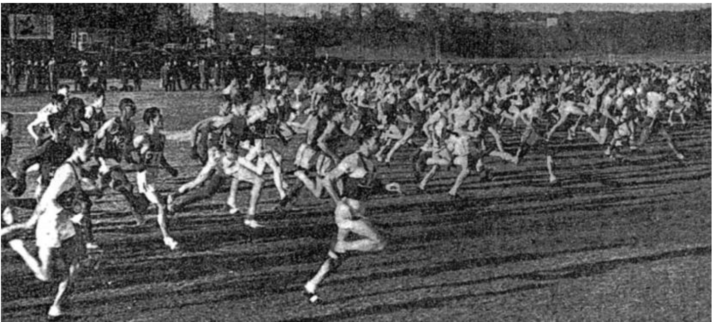
At the start