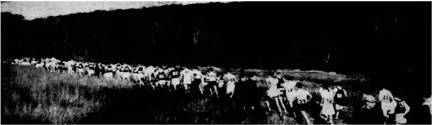
Into the woods