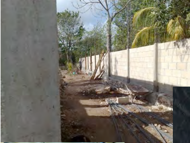
2009 the Mayan Mission Campus starts construction: The building of the Mayan base of operation started in 2009.