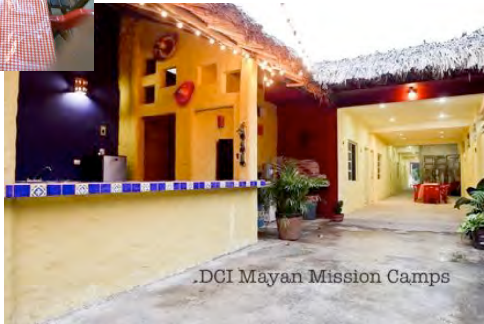
.DCI Mayan Mission Camps