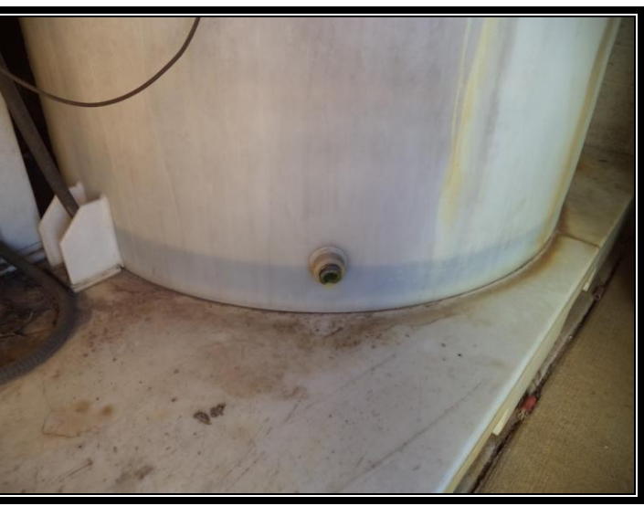
Photo No. 12: Bottom of one of the two larger tanks in air scrubber room, showing fluid level near the bottom.

Bender Environmental Consulting, Inc. 1929 E. Myrna Lane Phoenix, Arizona