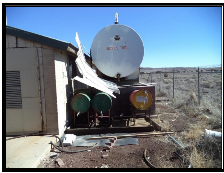
Photo No. 5: View of several drums on dispenser stands beside diesel fuel AST.