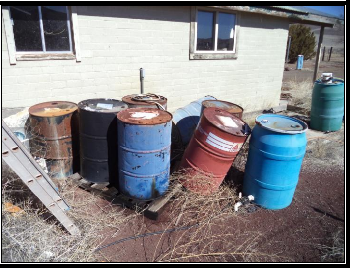
Photo No. 4: View of drums (mostly empty, some with waste oil) behind generator building.

Bender Environmental Consulting, Inc. 1929 E. Myrna Lane Phoenix, Arizona