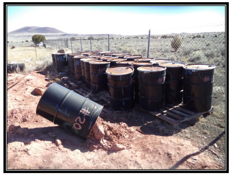
Photo No. 3: View of 37 drums of pinkish powdery material along south fenceline (sample COMP-2)