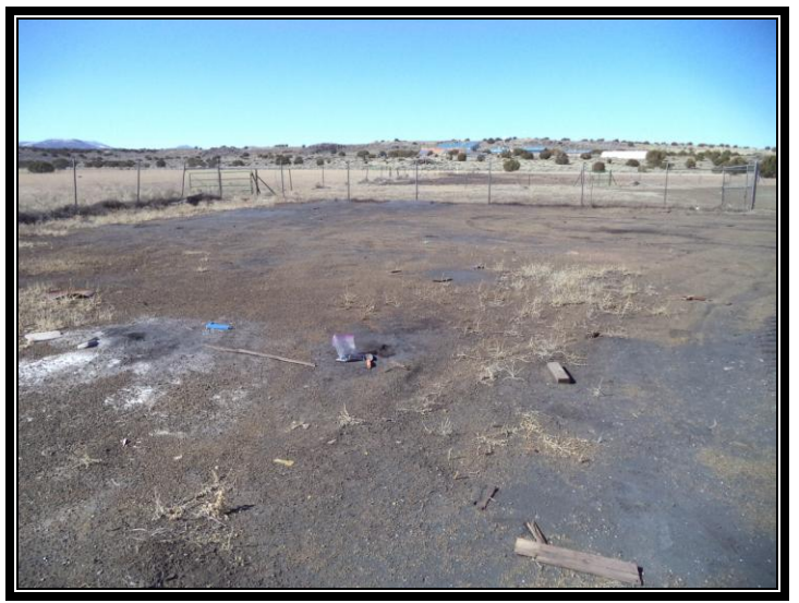
Photo No. 7: View looking north at area of dumped black grit, with sample COMP-3 being collected (trowel and baggy).