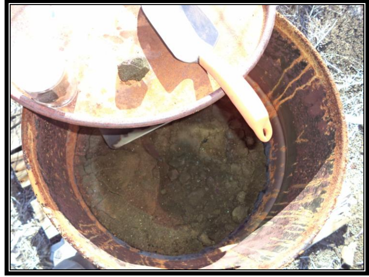
Photo No. 10: View of interior of drum containing possible gentian violet crystals.