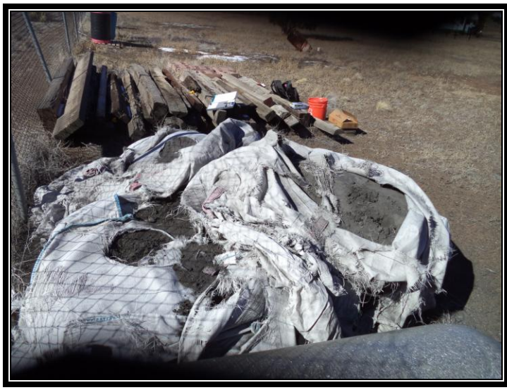
Photo No. 1: View of the three "super-sacks" of gray powdery material (sample COMP-1).