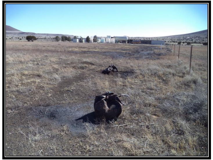
Photo No. 6: Looking south at several remnant drums with black grit material (sample COMP-4).