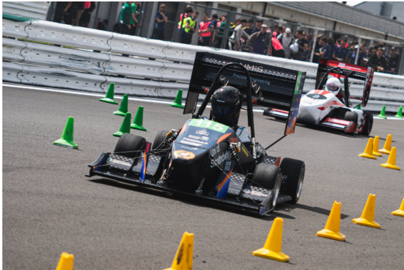
UNIVERSITY OF STRATHCLYDE MOTORSPORT

Finally, Sunday rolled around, and after a long night of fixing electrical issues, we were ready to take on the Endurance race. Some excellent driving over the 22km meant that the car took the chequered flag in the event, for the first time in 8 years! This was an unbelievable moment for the team.