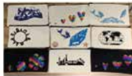
Explore Pencil Cases! £2.00