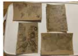
Explorers Postcards Set A £2.00