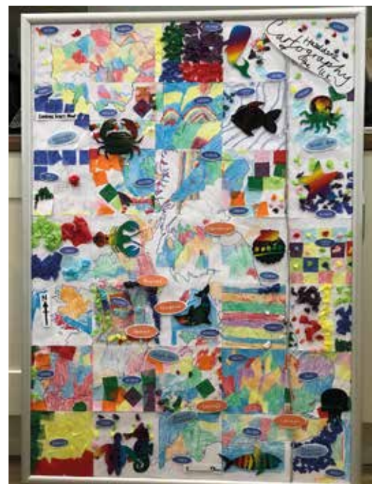
Imagery taken at Hazeldene School, Bedford for their SHINE DAY 2017