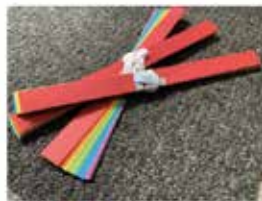
Rainbow Paper Chains £0.50