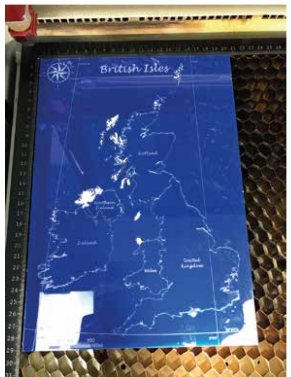
Using Technology to create Mapping products