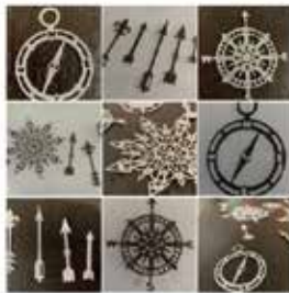
Crafty Compasses, Arrows and N Arrows