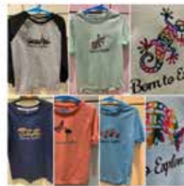
Born to Explore T-Shirts! £4.00