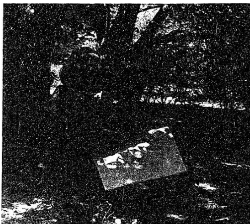
Collegian Photo by Pierre Bellicic