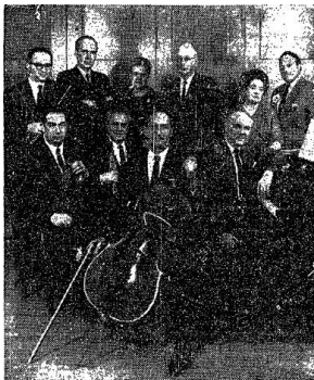
EACH OF THE NINE MUSICIANS IN THE BACH ARIA group is world-famous in his own right—so much so that each as a solo performer commands nearly the fee of the whole group. They will render portions of the tuneful, yet inspiring, music Bach wrote for Leipzig churches at 8:30 tomorrow night in Schwab. Tickets are available free to students at the Hetsel Union Building desk.

Questions concerning rush can be answered at the IFC office by calling 855-3455. For questions concerning a particular fraternity, rushees should contact the rush chairman of that house.