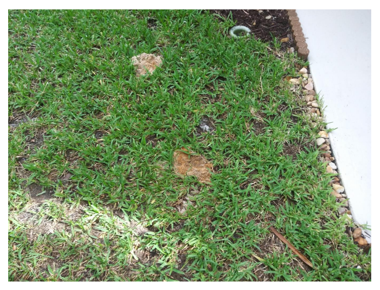
Figure 4: Moles 203 F