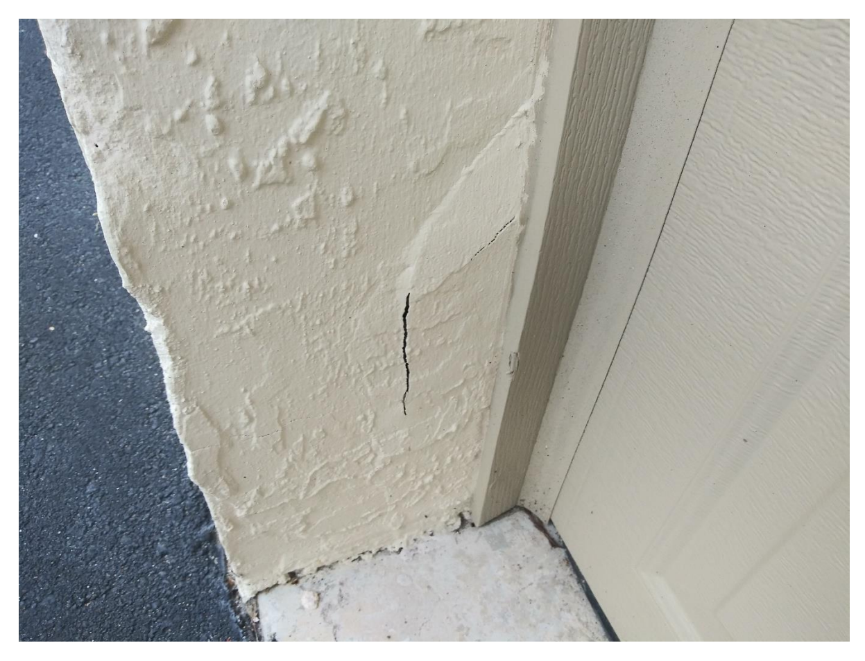
Figure 2: 201 C Garage Crack