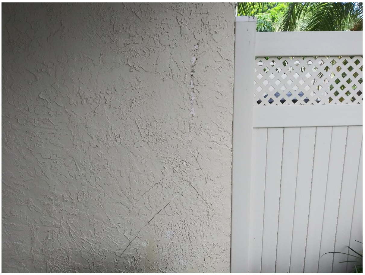
6: Paint 201 A Back