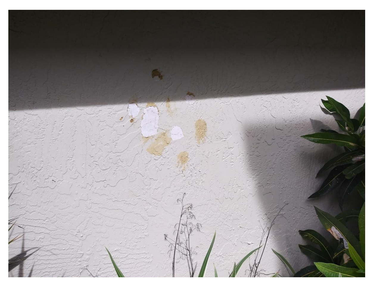
Figure 3: 201 C Garage Paint