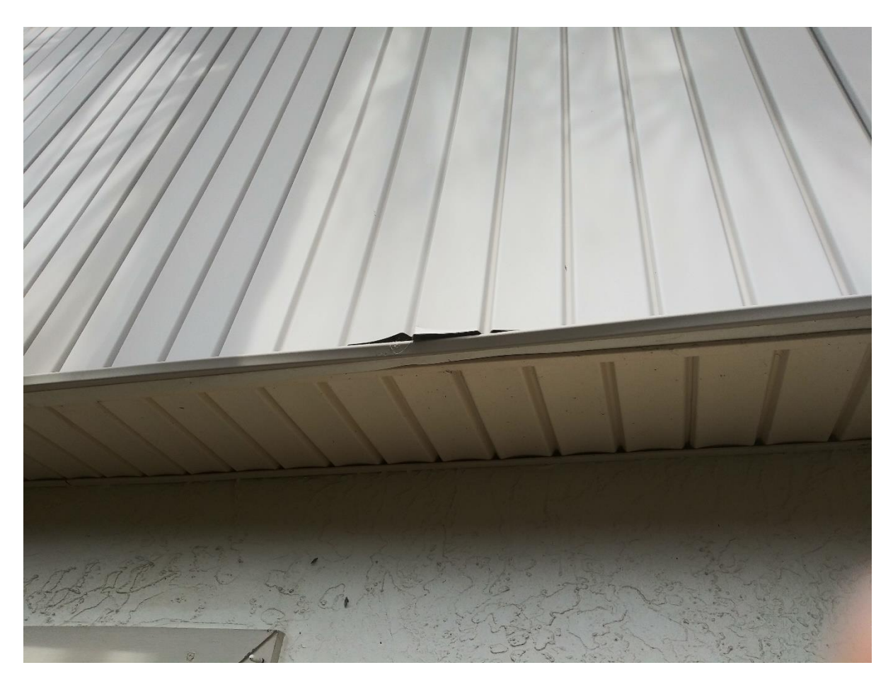
Figure 1: 203 B Siding

Inspection performed by Tony Spagnolia morning of August 22, 2021. 1.5 hour inspection time. Report completed August 23, 2021