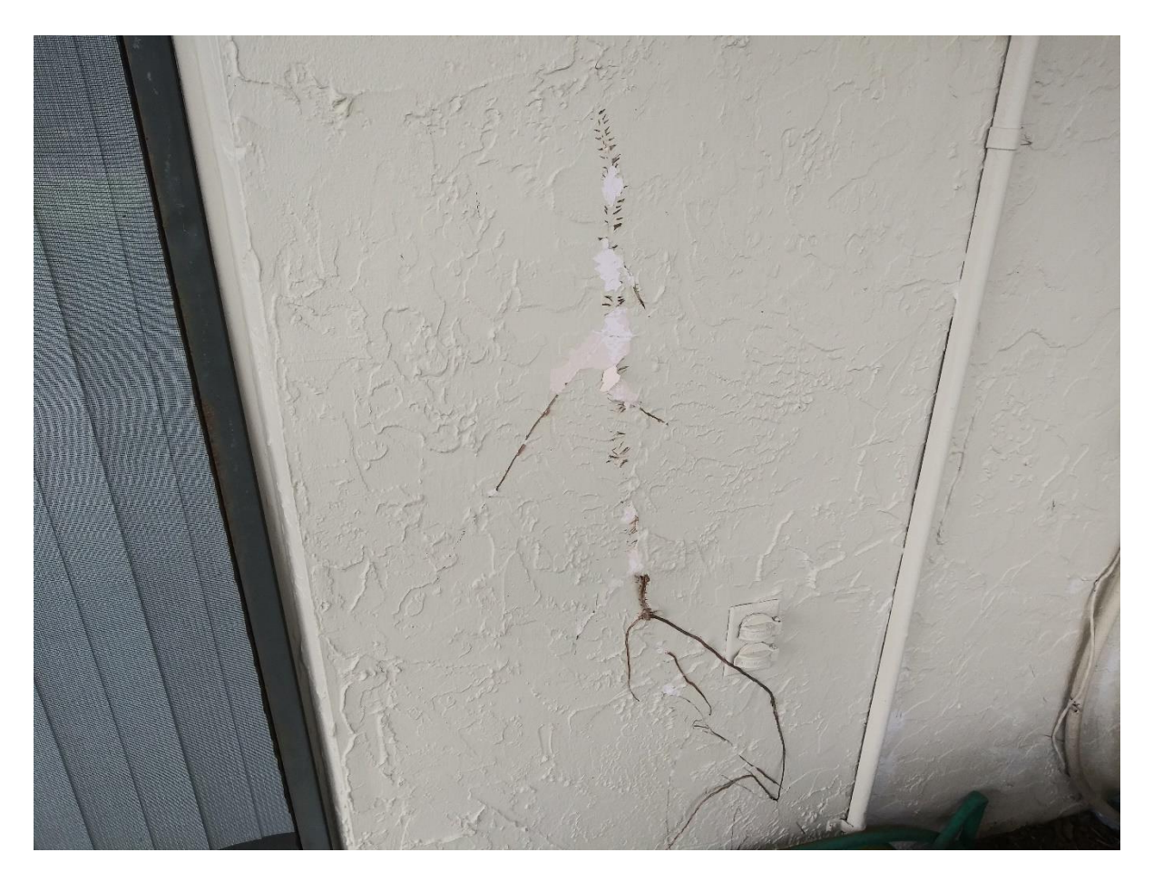
Figure 5: Paint 201 A Back