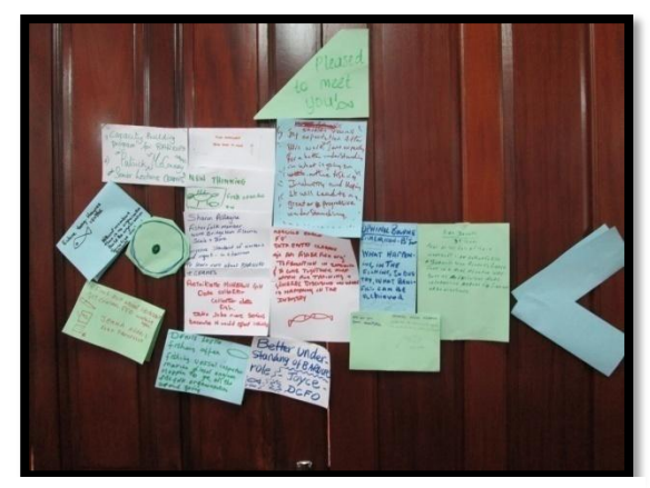
Participants created business cards with their roles in the fishing industry and expectations of the workshop

Hope that BARNUFO will reach the fisherfolk in a more meaningful way, such as extending more information to fishing organisations