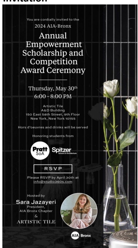
Sponsored by Artistic Tile Company — A&D Building 150 East 58<sup>th</sup> Street, 9<sup>th</sup> Floor, NYC, 10155

Some of the Bronx Chapter Members attending