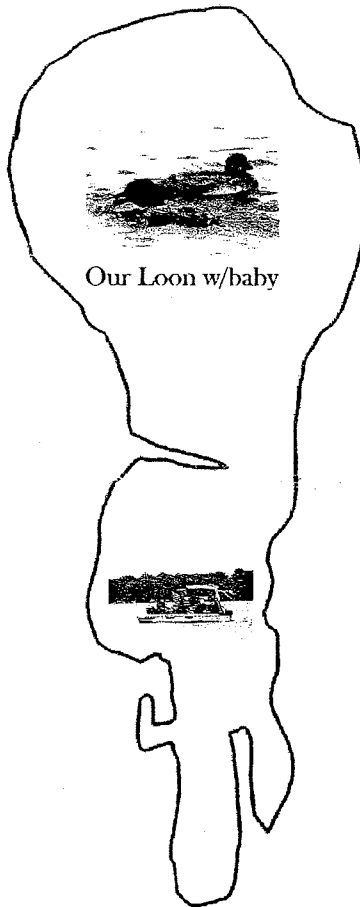
Our Loon w/baby