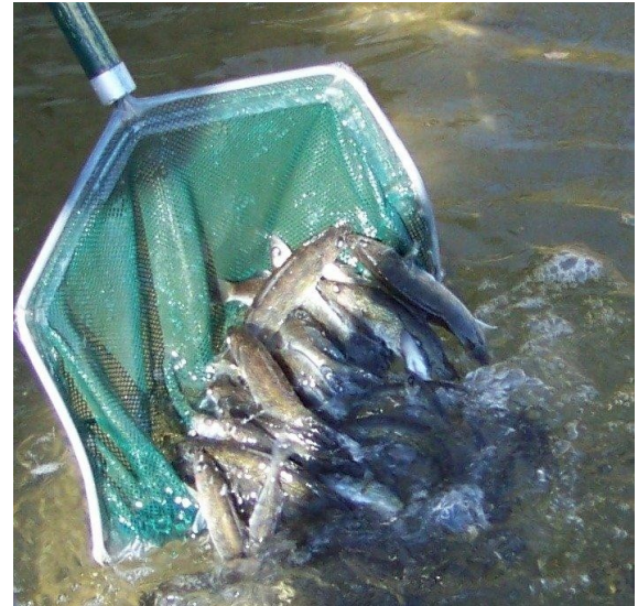
Sample of Walleye Fingerlings

Cedar Lake can be a great place to observe waterfowl migrating in the fall. It is one of the last lakes in the area to freeze over, so this provides late season viewing of various species of waterfowl. Last fall, just before Thanksgiving, flock after flock of Tundra Swans decided to rest on Cedar Lake for a few hours before continuing their migration. Normally they stop on the Mississippi River in South-eastern MN, but for some reason they decided to use Cedar Lake for a short resting place. What a site it was!!