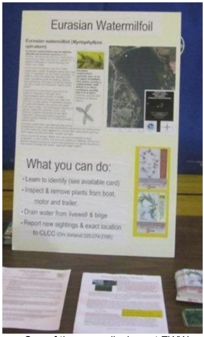
One of the many displays at EWW

The Cedar Lake Conservation Club hosted its first "Earth Wings and Water" Day on Saturday, June 18<sup>th</sup> at Camp Courage. Even though the weather wasn't cooperating, it was a wonderful event with over one hundred people attending.