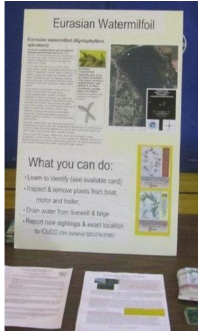
One of the many displays at EWW

The Cedar Lake Conservation Club hosted its first "Earth Wings and Water" Day on Saturday, June 18 th at Camp Courage. Even though the weather wasn't cooperating, it was a wonderful event with over one hundred people attending.