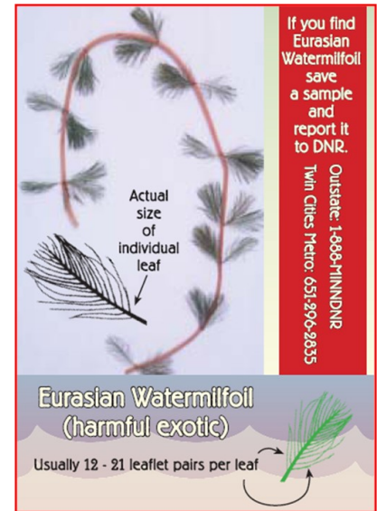
Eurasian Milfoil (harmful exotic)