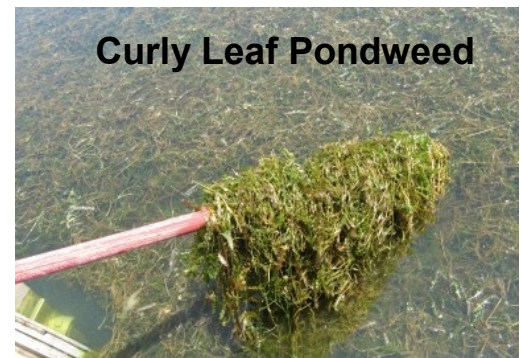
Curly Leaf Pondweed