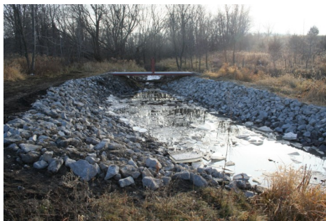
Segner Pond Rebuild