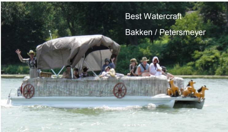
Best Watercraft Bakken / Petersmeyer

Many participated and took a tour around the lake, sharing their patriotic enthusiasm with those on shore.