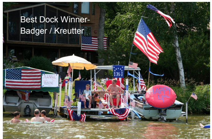
Best Dock Winner- Badger / Kreutter