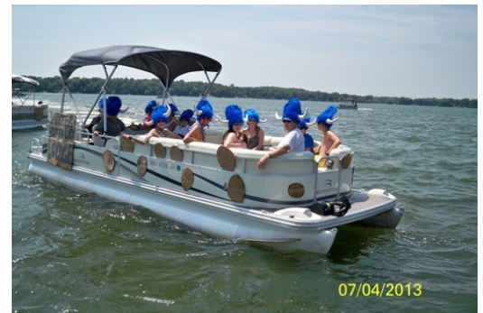
The Bakken Family

See p. 3 and visit the CLCC website ( cedarlakecc.org ) for more pictures from the 4th