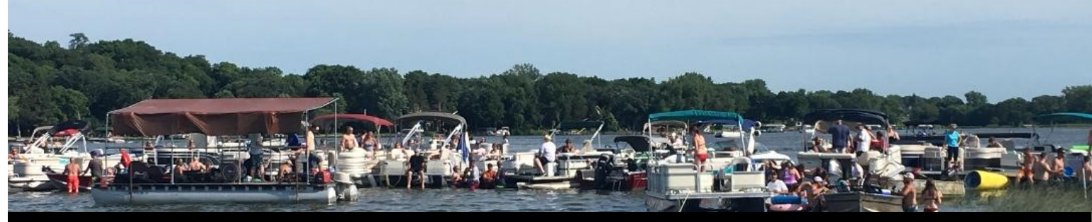
Music on the Water July 20 | Rained all morning and the skies cleared just in time for dancing on the water.