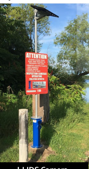
I-LIDS Camera at Lake Sylvia