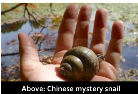
Above: Chinese mystery snail Below: Areas in red infested

Chinese mystery snails are considered an invasive species, but their impact is not fully defined. There are still questions as to whether these large snails harm lakes. They can produce large numbers and serve as a host for swimmers itch, but scientists have not clearly identified a severe impact to the lakes they infest. They can serve