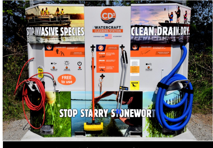
CD 3 at Cedar County Road 6 Access

The new Cedar Lake CD3 was purchased by the CLCC and donated to Wright County. The Schroeder Park CD3 was a