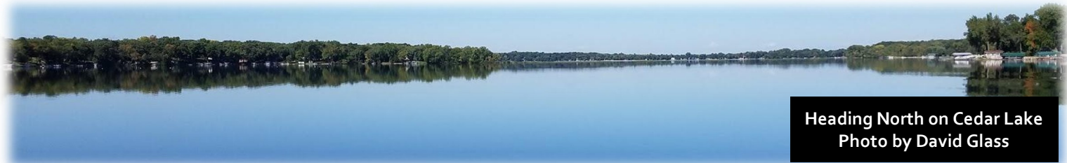
Heading North on Cedar Lake