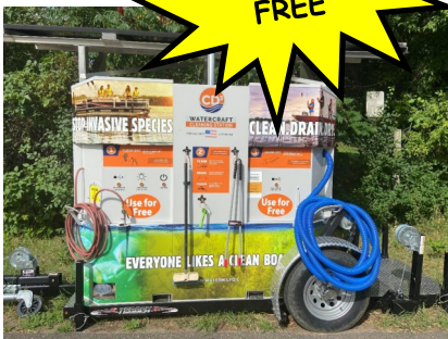
Free self-serve watercraft cleaning stations at Schroeder Park (north side) and CTY RD 6 (west side) launches.