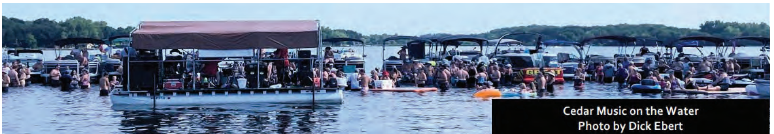
Cedar Music on the Water

Note: CLCC Board of Directors not eligible for contest.