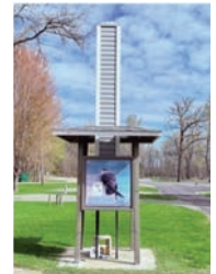
Chimney Swift tower at camp Schroeder