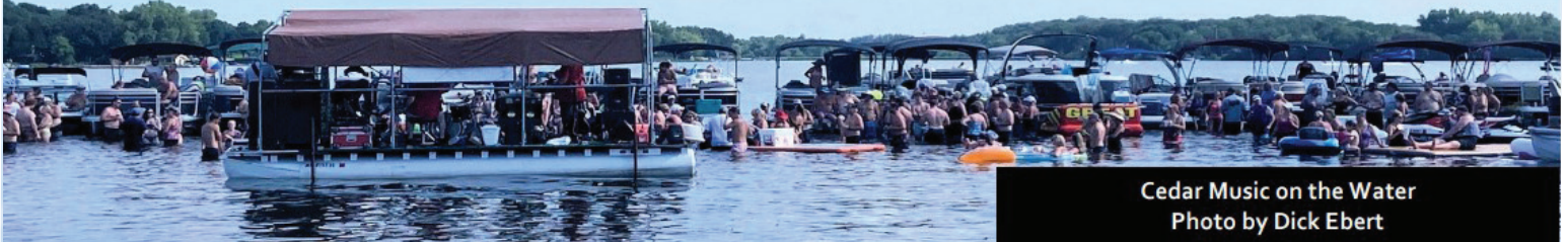
Cedar Music on the Water

No reservations needed - just float in and enjoy!