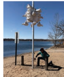
Dave Stepp setting up the Purple Martin Houses

We are attempting to attract Chimney Swifts to the tower at Schroeder Park. We are playing the Swift call (not that Swift) to attract migrating birds and help them find the tower in the hope they will begin nesting there. Chimney Swifts spend almost their entire day in flight, catching insects in midair and only landing to roost at night. Visit the tower at Schroeder Park to learn more about this unusual bird.