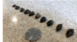
Cedar Zebra Mussels May 2019 Found attached to vegetation

If your watercraft is "resident" to Cedar (e.g. in the lake all summer) there is a good chance it will have zebra mussels. Given this knowledge, and the time and difficulty for a complete decontamination, consider not visiting other lakes with your watercraft. Likewise, docks and lifts are favorite hiding places for zebra mussels, so sell or buy used equipment only if it has over-wintered before moving to a different lake.