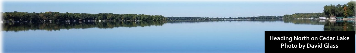
Heading North on Cedar Lake