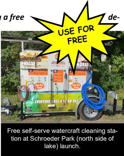
Free self-serve watercraft cleaning station at Schroeder Park (north side of lake) launch.