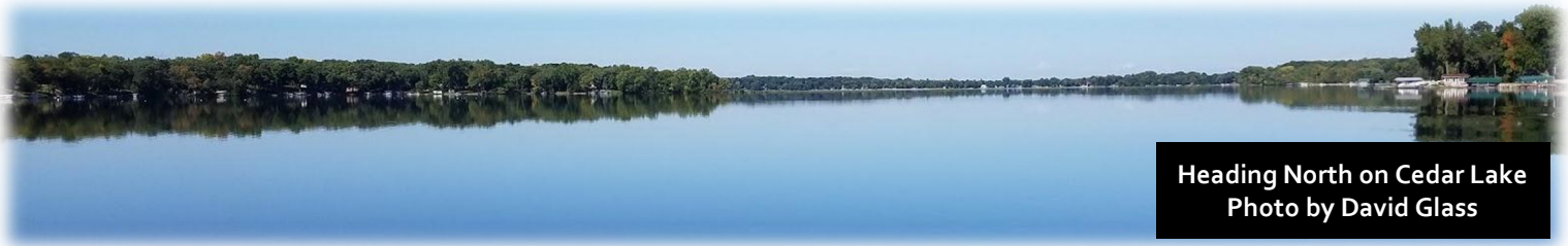
Heading North on Cedar Lake