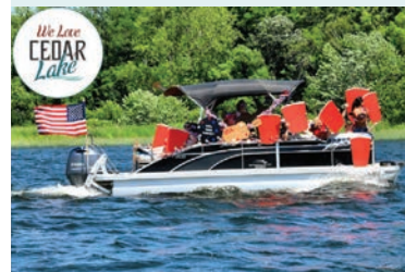
Most Enthusiastic - Red Solo Cup - Emerson Family