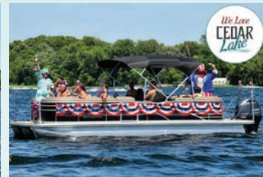
Most Patriotic - Maass Family