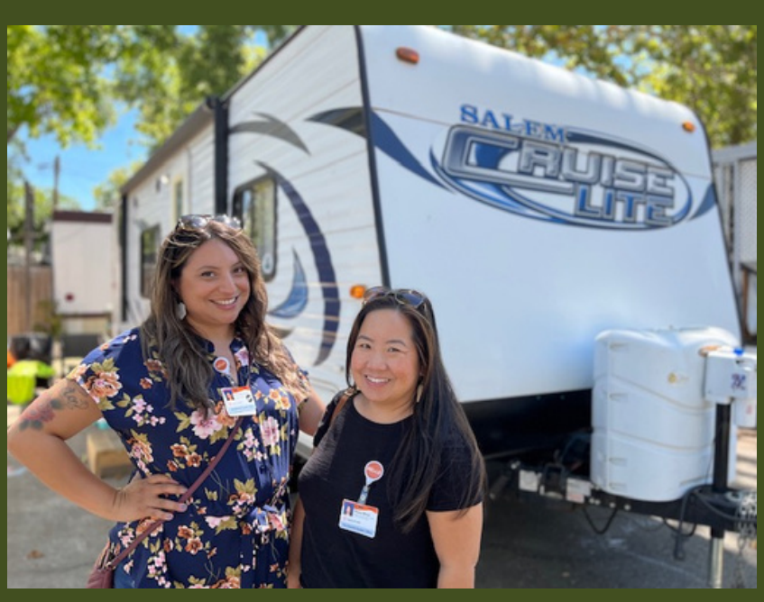
*Pictured are two Dignity Health Foundation staff in front of one of the newer trailers EMM was able to purchase with grant funds.