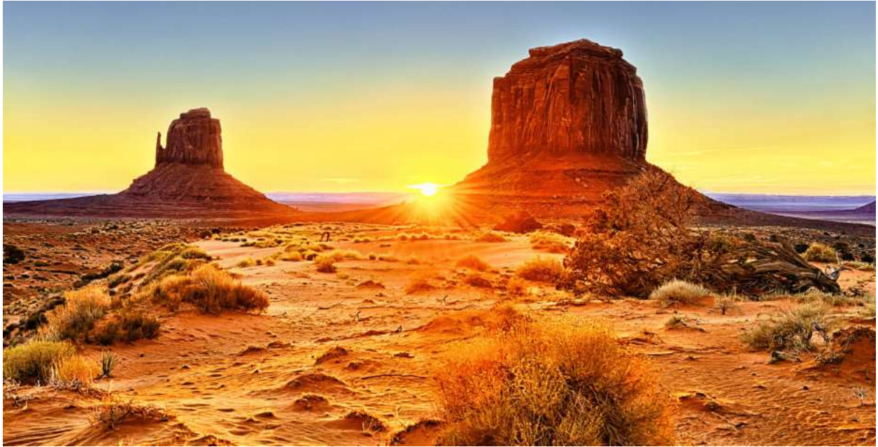
US Indigenous People's Day in USA October 14, 2024