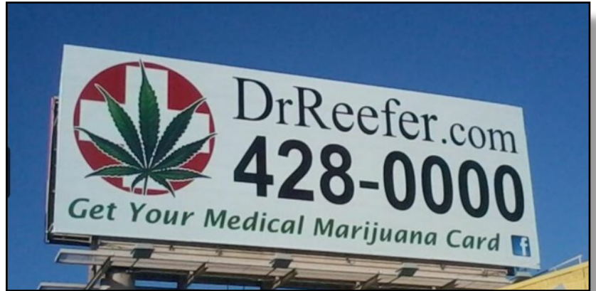
HIGHWAY ADVERTISING targets in-state and out-of-state residents alike

surged. The past President of the Colorado Association of Chiefs of Police stated last year that "Organized crime filings have skyrocketed in Colorado since marijuana legalization. We had 1 filing in 2007 and by 2015, we had 40."