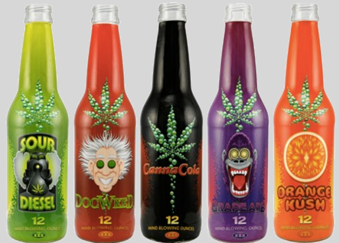
THC-infused sodas currently on the market as of February 2017.