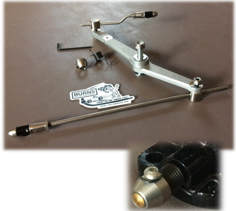
Detail - Throttle Return Set-Up on Single Carb Linkage

Burns throttle linkage kits are now available to ease the installation of single or dual carbs on your Burns manifold. These kits use the Burns aluminum throttle arm, Stromberg rod ends, Stromberg linkage to connect the dual carbs and easily adjustable swivels of our own design. Both feature a throttle return set-up developed in conjunction with Stromberg Carburetor Co. that does away with the need for any additional return springs.