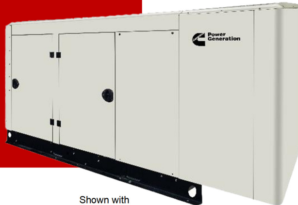
Shown with Sound Level 1 option