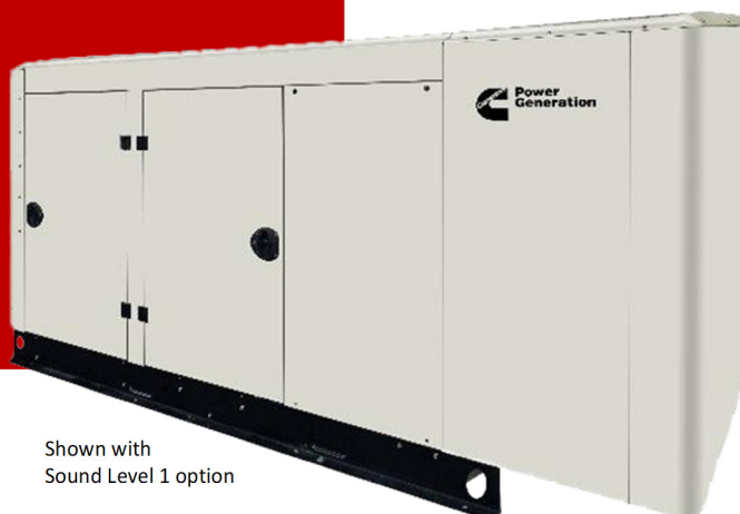
Shown with Sound Level 1 option