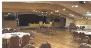
The Bravo Lodge's building sits on almost 2 acres.