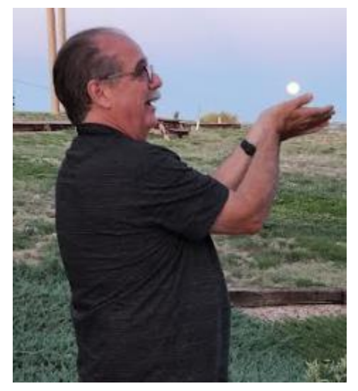
Our Pres....holding the moon in the palm of his hand!