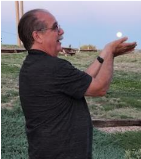
Our Pres....holding the moon in the palm of his hand!