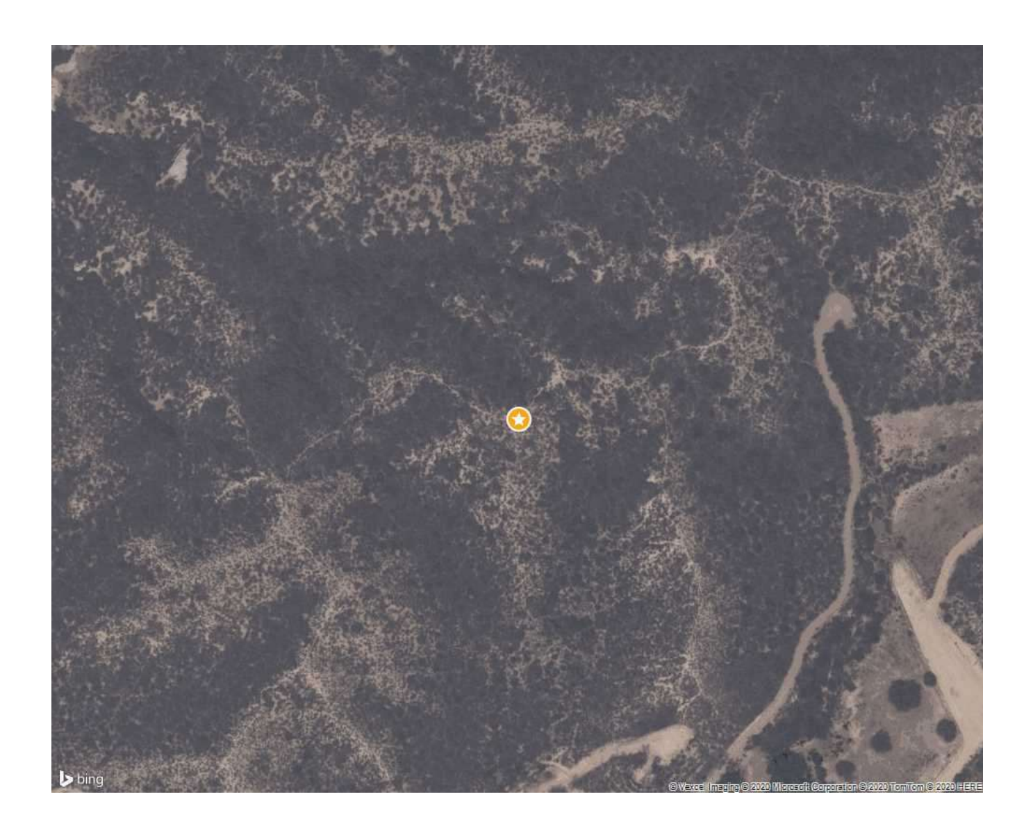
JAMUL, CA 91935-