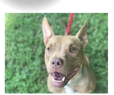
Please adopt us!