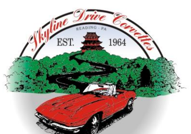
to benefit the Animal Rescue League