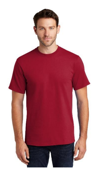
Port & Company PC61 / PC61T (tall) Essential Cotton Tee