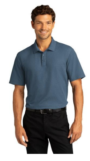
Port Authority K810 Super Pro React Polo