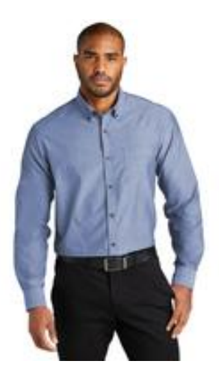
Port Authority W382 Chambray Easy Care Shirt

Port Authority LW382 Chambray Easy Care Shirt