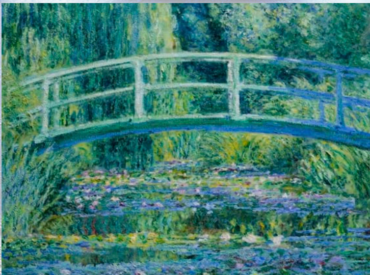
"Bridge Over a Pond of Water Lilies" by Claude Monet.

Using 3D technology, Lasting Impressions allows viewers to immerse themselves in impressionist paintings.