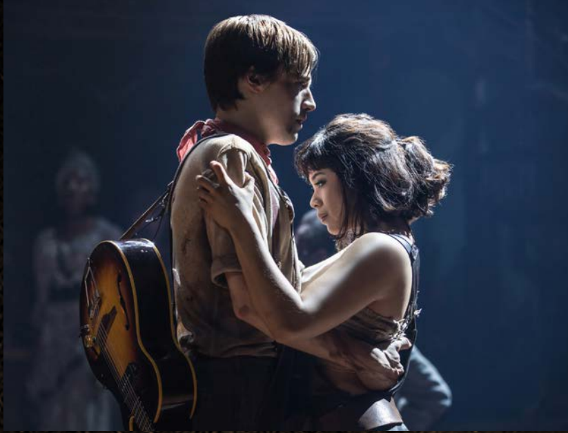
Reeve Carney and Eva Noblezada starred in the original Broadway cast of Hadestown.

You've heard it said that a musical is never finished, it's only abandoned? There is a way in which it was, "Pencils down!" at a certain moment, and