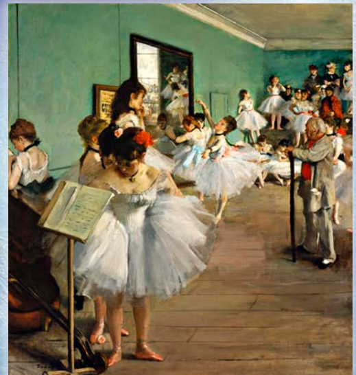
"The Dance Class" by Edgar Degas.