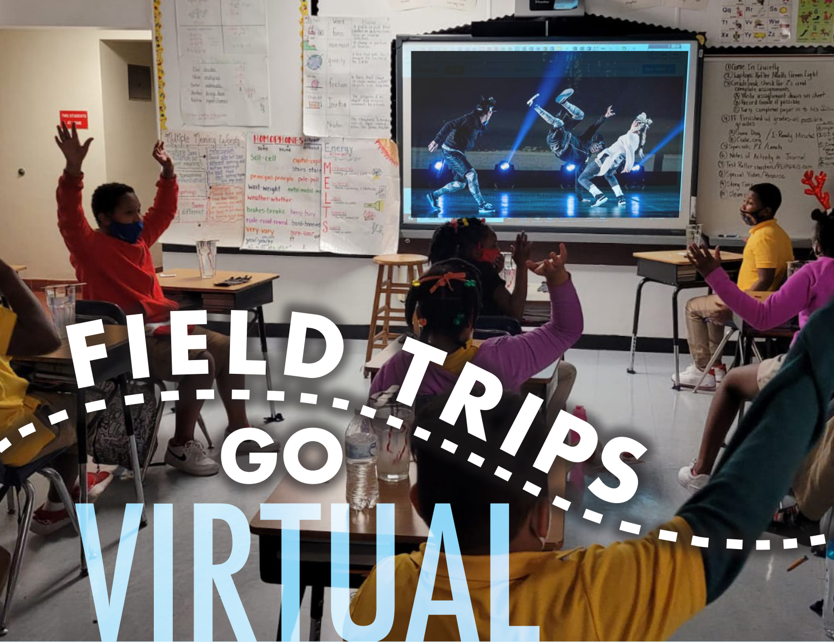
Students at William Chapman Elementary watch The Hip Hop Nutcracker as part of the Miami Arts Education Collective's outreach program.