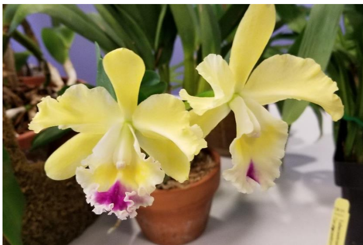
Rlc. Santa Fe Gold and Spir. Speciose