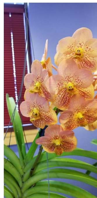
V. Kasem's Delight 'Big Black', V. Kulwadee Fragrance, and V. Motes Goldpiece 'Twentyfour Carat' AM/AOS