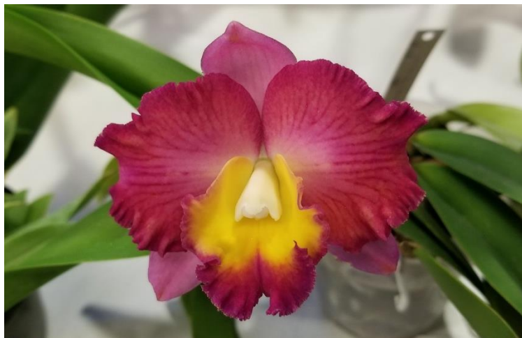
Rlc. Fordyce Prelude 'First Act'