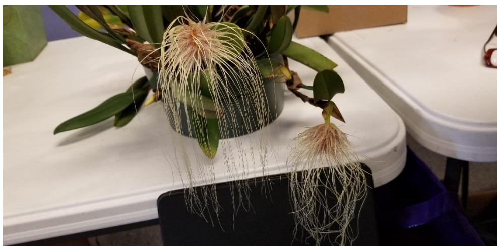
Cym. Sweetheart 'Spring Pearl' AM/AOS and Bulb. medusa