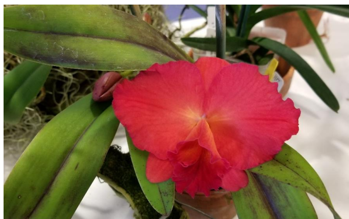
Ddc. luzonense and C. Circle of Life 'New Ace' AM/AOS grown by Lois Daulesberg