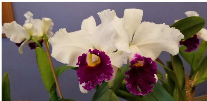
C. Orglade's Grand 'Yu Chang Beauty' AM/AOS grown by Jack Willcox