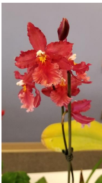
Rlc. Santa Fe Gold and Ons. Pacific Perspective