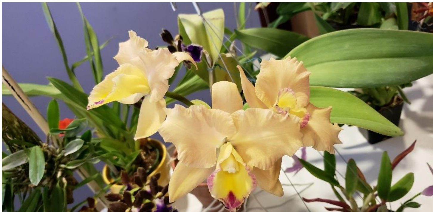
Rth. Cashens' Silk D'Or 'Redland Sunset'

A few more of Roger's January 2019 Blooms: