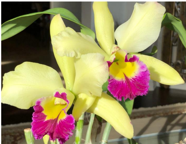
Paph. venustum 'Foxcatcher' FCC/AOS, Angcm. Sesquipedale and Rlc. Greenwich 'Killarney' HCC/AOS