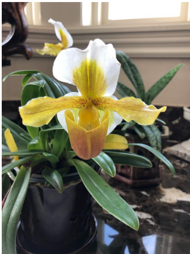
C. Horace 'Maxima' AM/AOS and Paph. Barbi Playmate 'Hampshire' AM/AOS