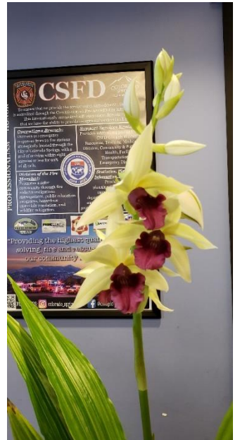
Cym. Sanderae, Paph. unknown (Large yellow) and Gp. Micro Burst