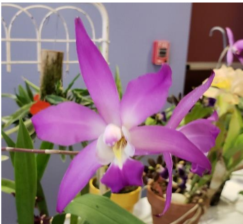
Mica. Ringens and L. gouldiana