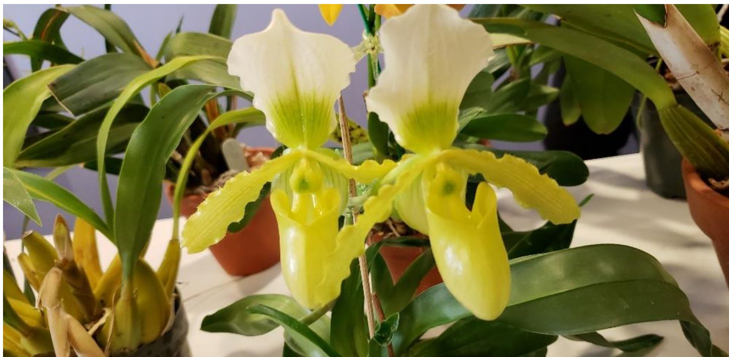
Paph. Meda Ballard