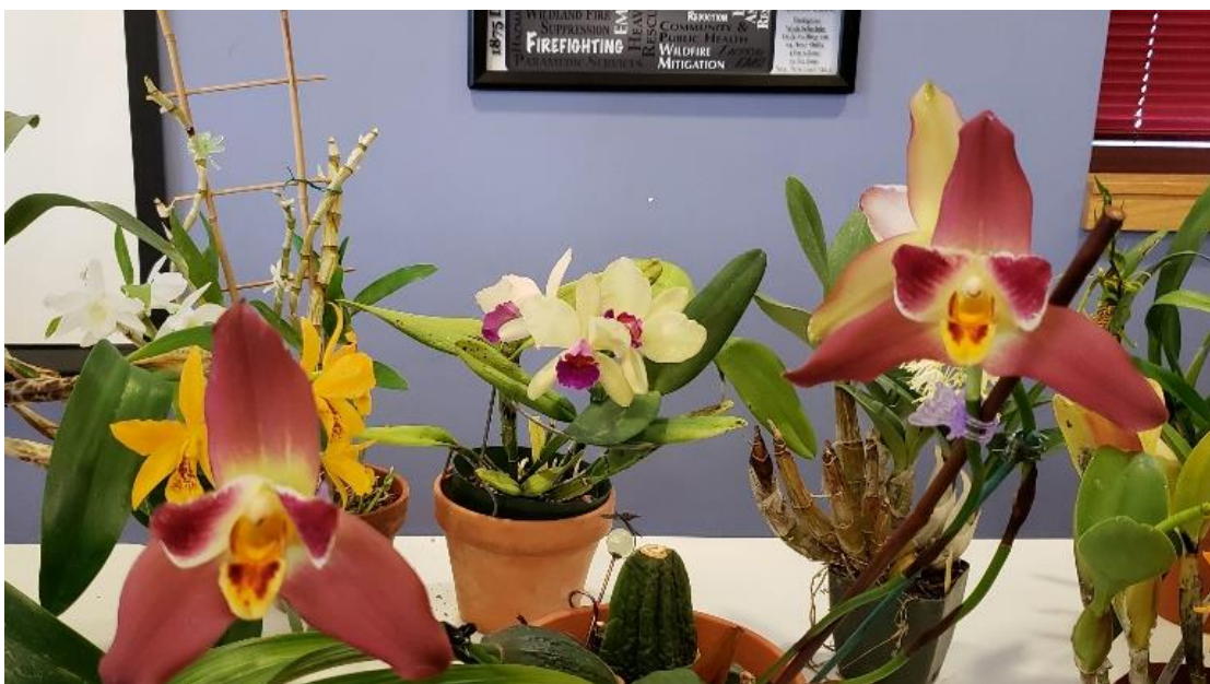
Lys. Red Jewel