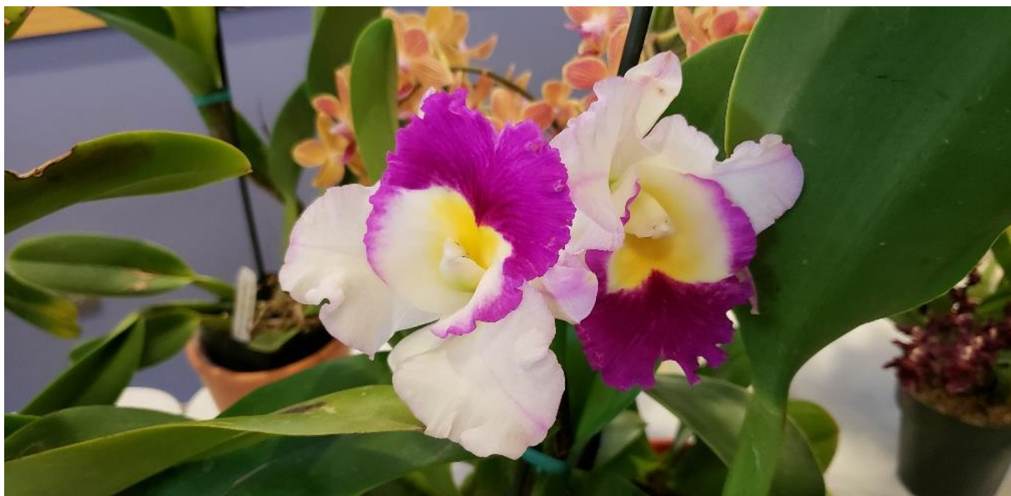
Rlc. Memoria Anna Balmores 'Carmela' AM/AOS