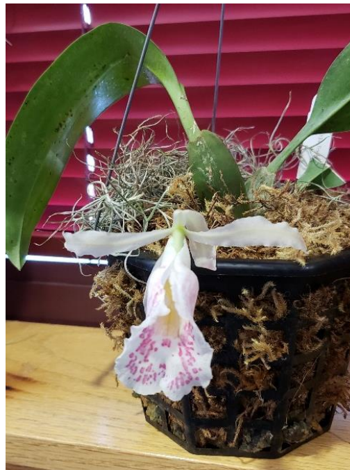
Trpla.? grown by Amal Cooke