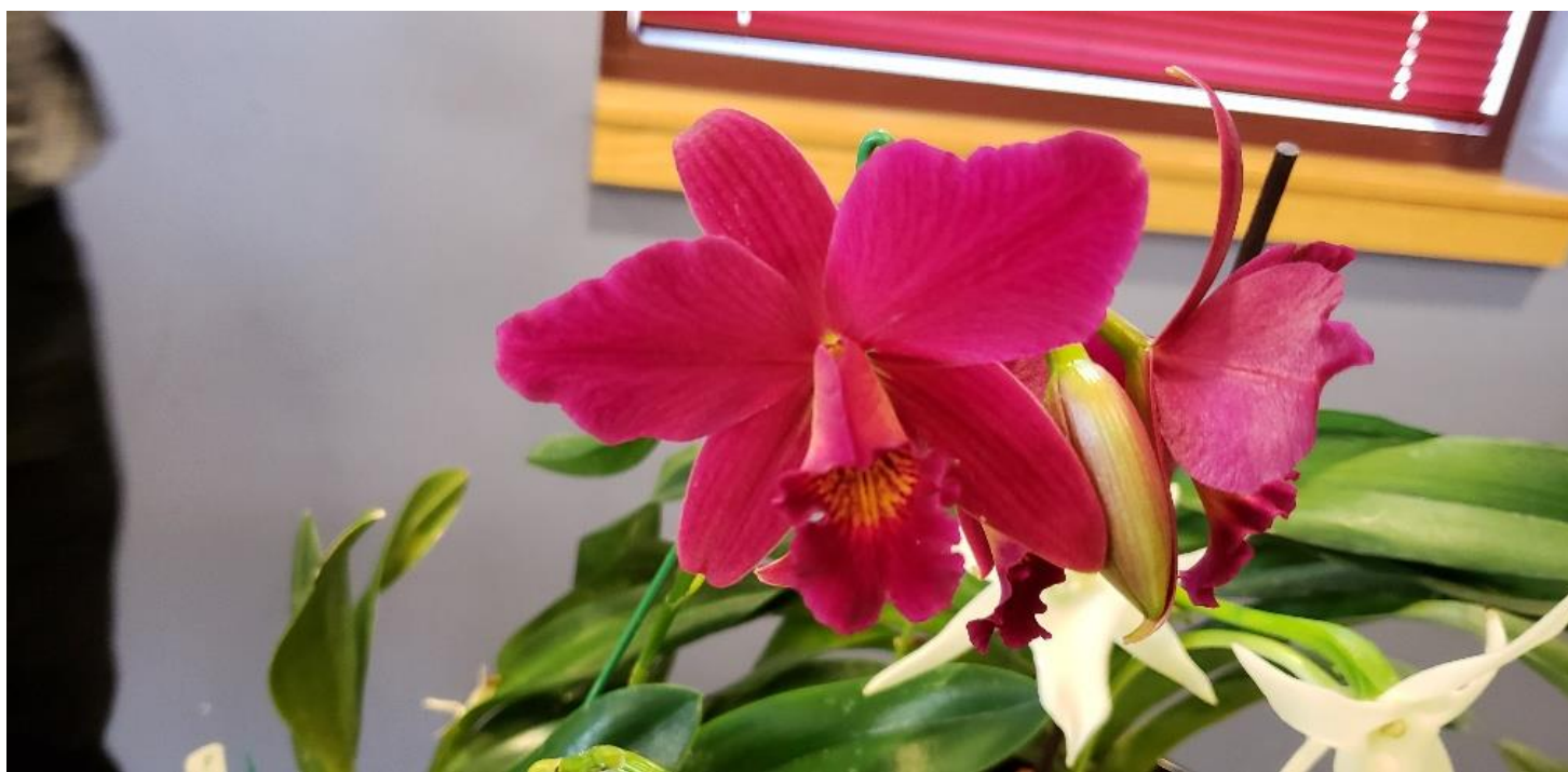
Lc. 'Red Beauty'