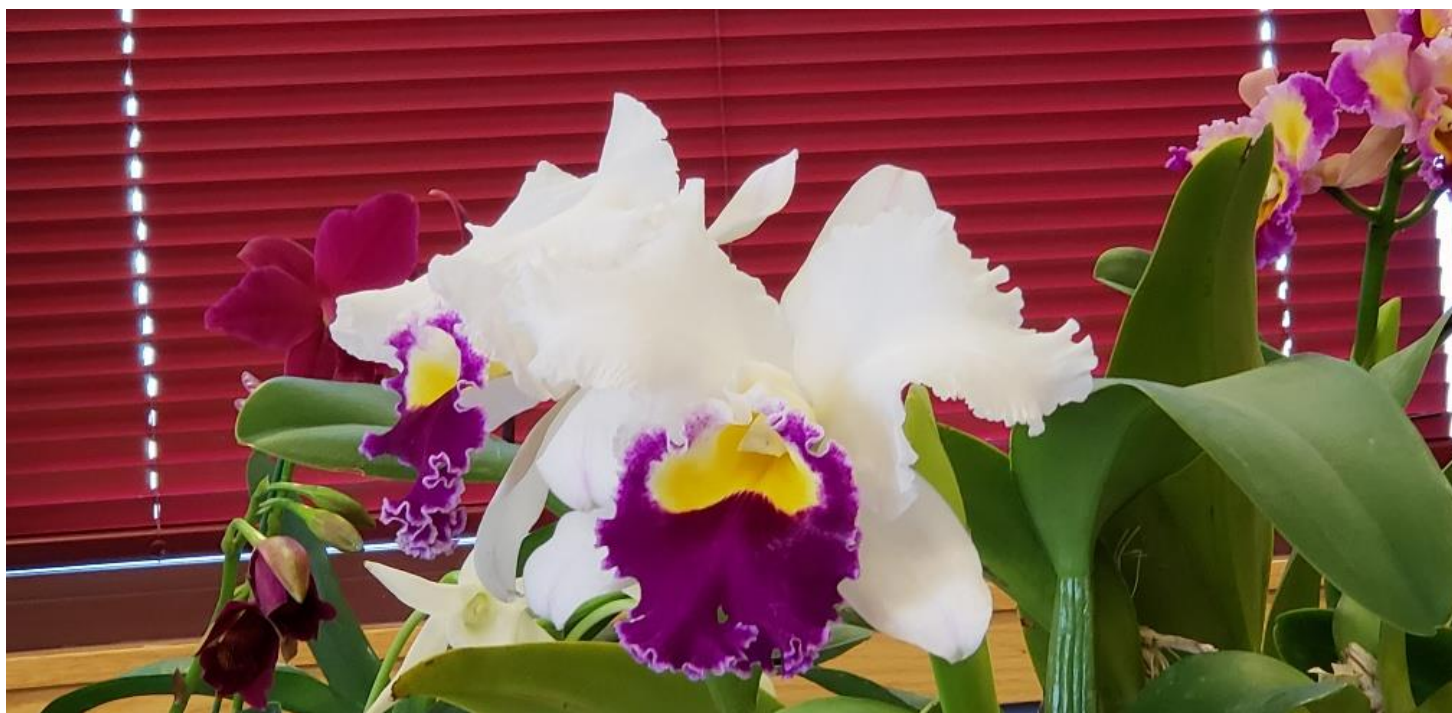
C. Orglade's Grand 'Yu Chang Beauty' AM/AOS