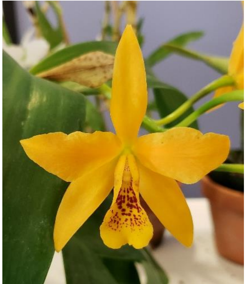
V. Hybrid and Ctt. Gold Digger 'Orglade's Mandarin'