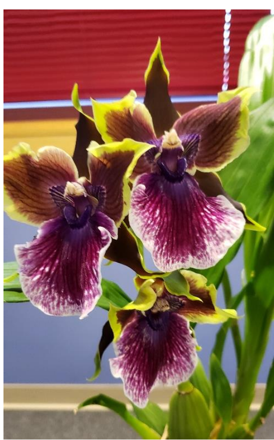
Drac. Verticulosa and Zglm. Rhein Moonlight