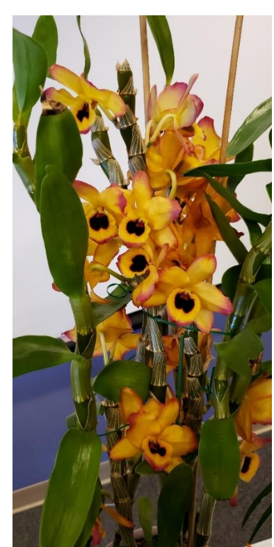
Den. Bridal Red 'Celebration' and one of four nobile type dendrobriums, no name.