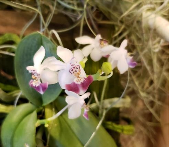
Paph. Harvest Time 'Languedoc' and Phal. parishii