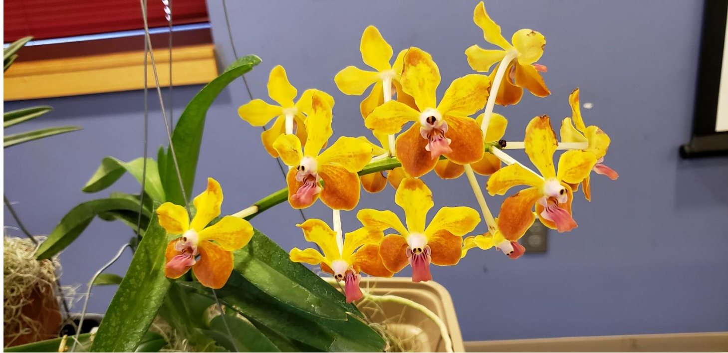
V. M. V. Tannins 'Starburst'