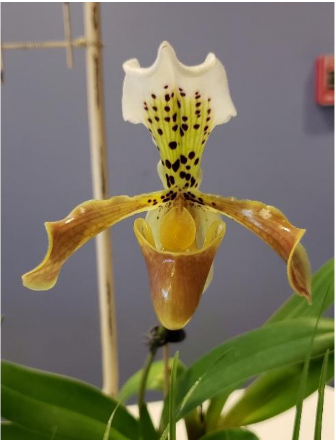
Angcm. leonis and Paph. gratrixianum