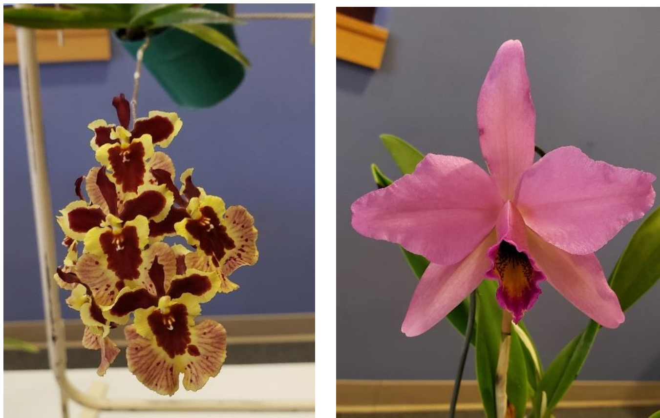
Tolu. Esther Oka 'Lake View' HCC/AOS and Lc. Caligula

A few more of Roger's March 2019 Blooms: