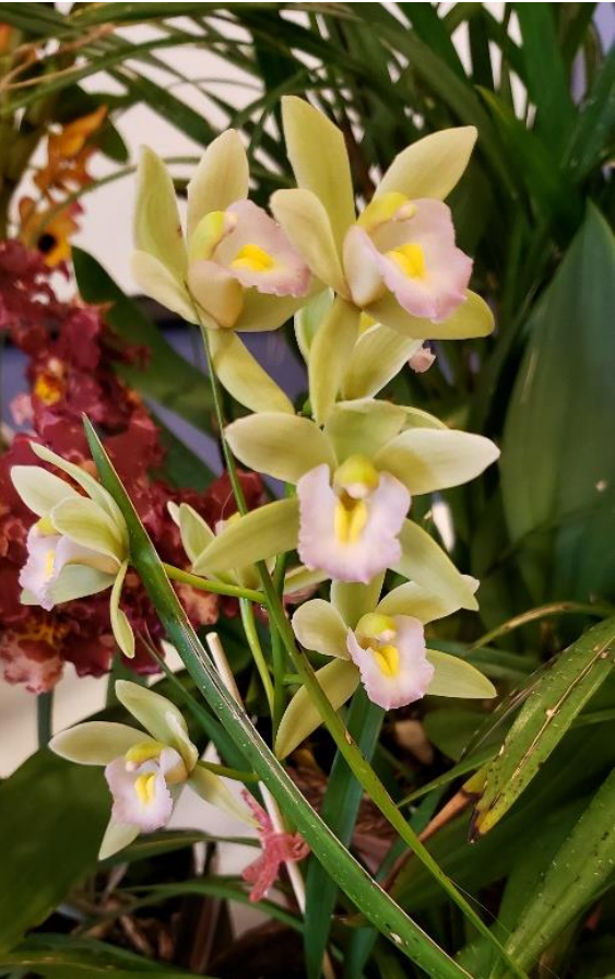
Ons. Eye Candy 'Pinkie' and Cym. Sweetheart 'Spring Pearl' AM/AOS