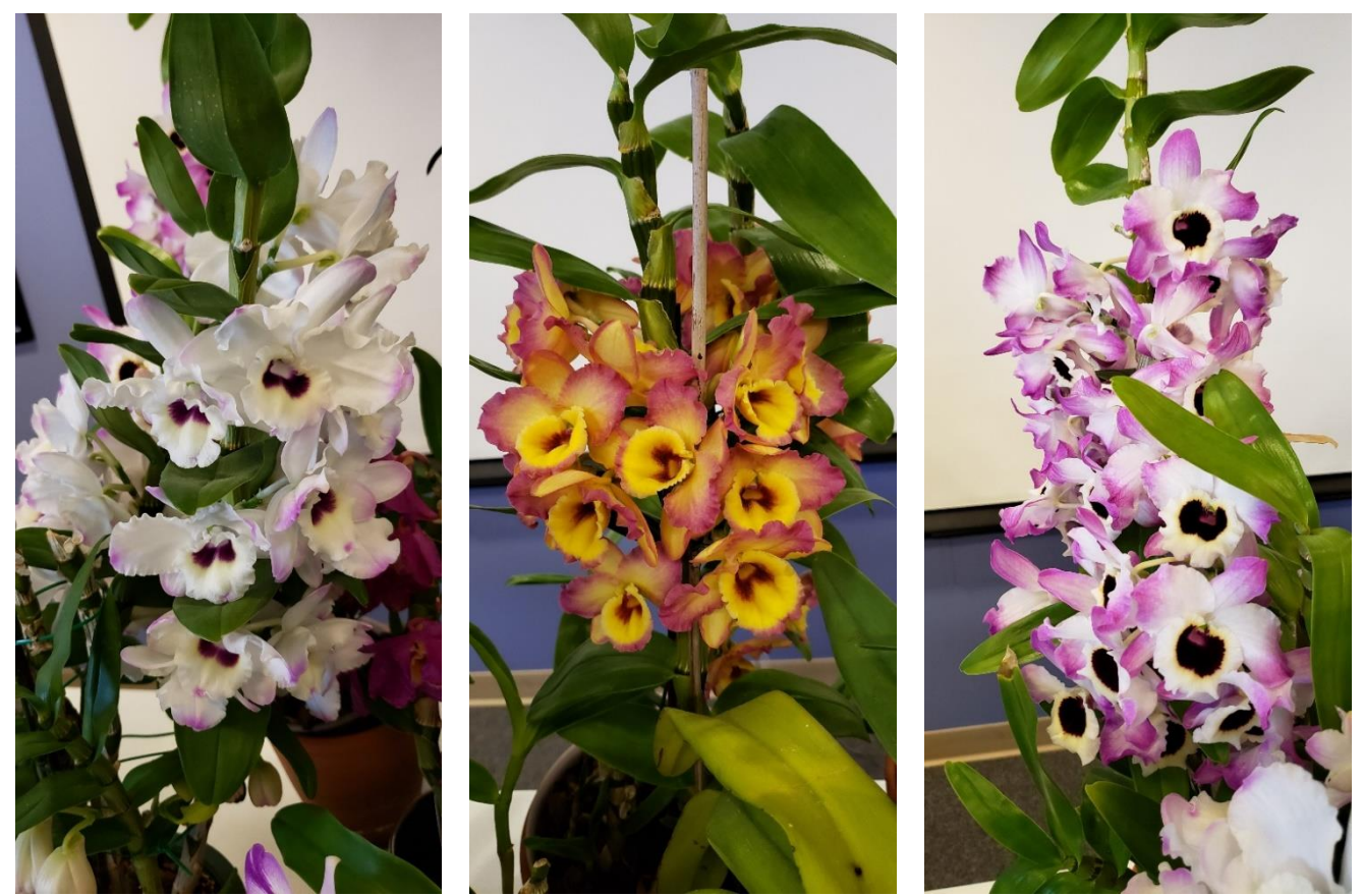
3 more nobile type dendrobriums, no name grown by Jack Willcox