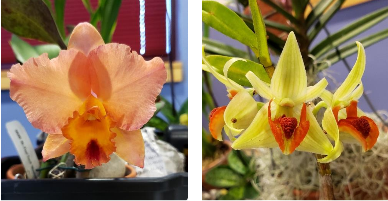
C. Final Touch 'Mendenhall' AM/AOS and Den. cruentum