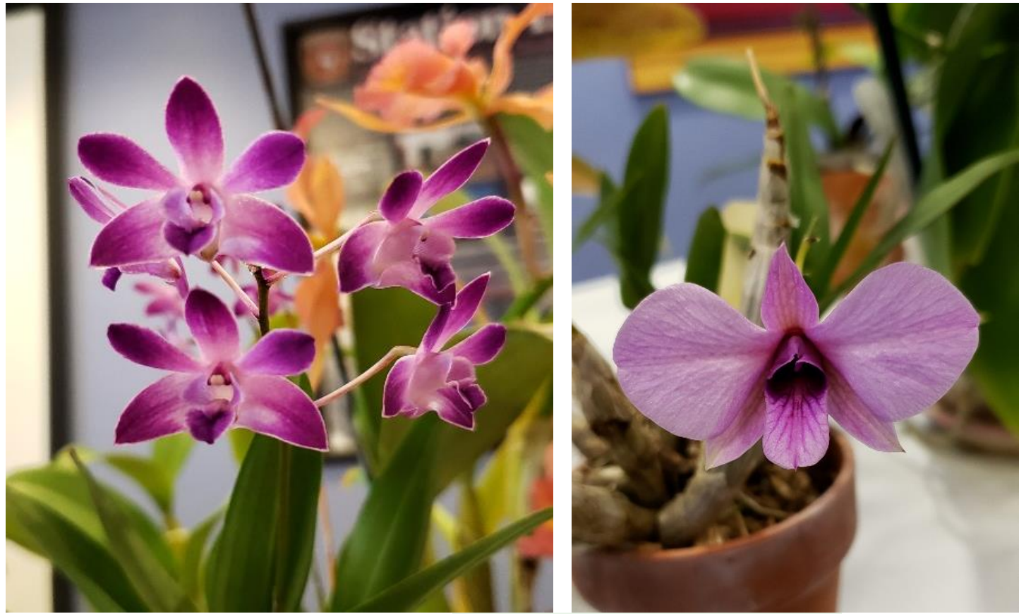
Den. Adelia Angeles and Den. biggibum var. compactum 'Zeschia Lynn'