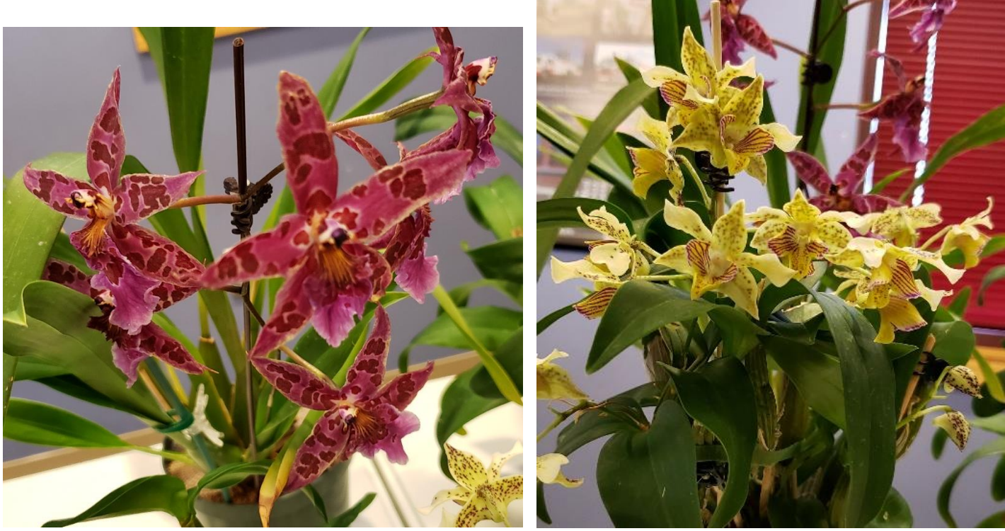
Mtdm. Saint Sand 'Pacific Sunset' and Den. SOOS Celebrates 50